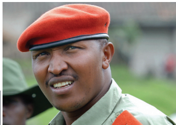
General Bosco Ntaganda

Former Tutsi rebel tasked with leading army operations in Kivu. Has set up parallel taxation system, reaping $250,000 per month, and is accused of war crimes