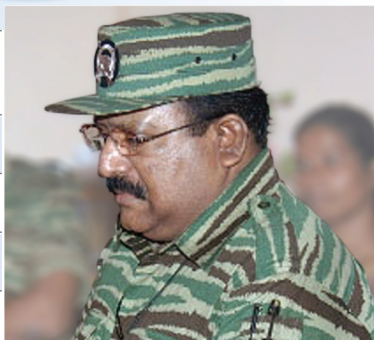
Valupillai Prabhakaran, LTTE founder and leader