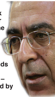
Palestinian Prime Minister Salam Fayyad

The Palestinian Authority is to ask foreign donors for $1.33bn to fund the reconstruction of the war-ravaged Gaza Strip. The Authority, which does not want funds to be channelled directly into Gaza – which is controlled by Hamas – is also seeking $1.45bn in budget support this year