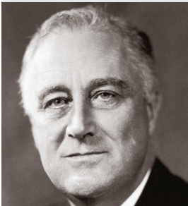
Franklin D. Roosevelt

1861-1865. His inaugural parade of 1865 included African-American troops for first time, heralding slavery's future demise