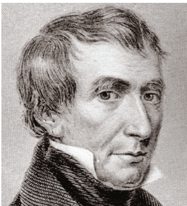
William H. Harrison

1789-1797. His phrase "So help me God" and kissing of bible after oath set a tradition upheld by other presidents since