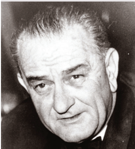
Lyndon B. Johnson

1933-1945. Popular president during World War II was sworn in for unprecedented third and fourth terms of office