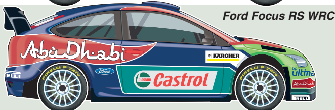
Ford Focus RS WRC

Hirvonen pushed Loeb all the way last season but in the end couldn't catch the Frenchman. Fellow Finn Latvala will hope to build on his success in becoming the youngest driver to win a race