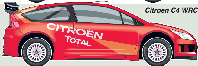
Citroën C4 WRC