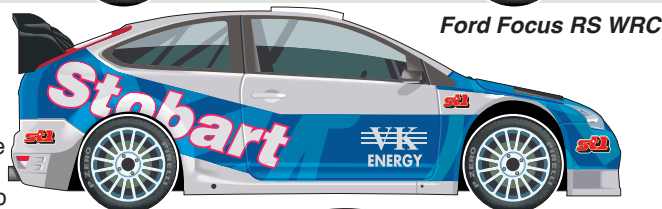
Ford Focus RS WRC

After a good 2008, briefly reaching third in the Championship table, the withdrawal of Subaru puts the team in a position to challenge the big two. Close ties to the Ford works team make for a strong driver line-up