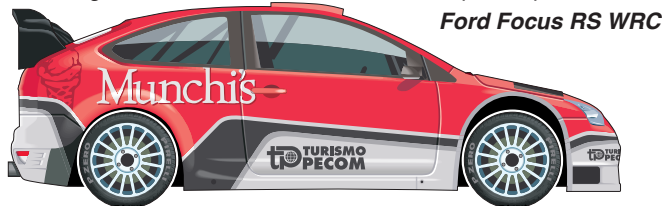
Ford Focus RS WRC