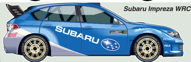
Subaru Impreza WRC

Norwegian-based team will keep the Subaru flag flying, but will require continued support of Prodrive – who masterminded Subaru's rally programme – to make an impact