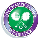
RAFAEL NADAL Spain