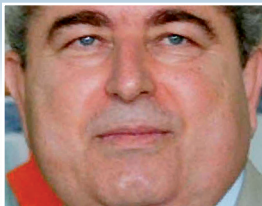
Demetris Christofias: Age 62. House President since 2001 and secretary general of communist Progressive Party of the Working People ( AKEL ). Backed by Front for Center's Reconstruction and United Democrats. Accuses Papadopoulos of failing to be pro-active in seeking reunification