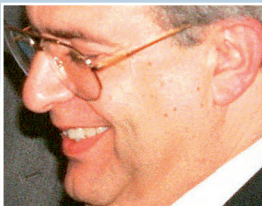
Ioannis Kassoulides: Age 59. Euro MP and former foreign minister. Right-winger backed by opposition Democratic Rally party ( DISY ). Helped negotiate admission to EU and supported reunification blueprint in 2004. Will work with UN secretary-general Ban Ki-moon to achieve reunification