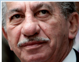
Tassos Papadopoulos: Age 74. Won presidency in 2003. Led rejection of UN-backed reunification plan in 2004 – regarded as a “no-compromise candidate” toward Turkey. Backed by his centre-right Democratic Party ( DIKO ), Social Democrats Movement ( EDEK ) and European Party ( EvroKo )