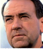
Mike Huckabee 40