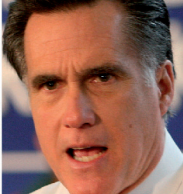
Mitt Romney 77