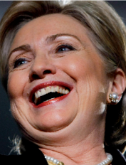
Hillary Clinton 261