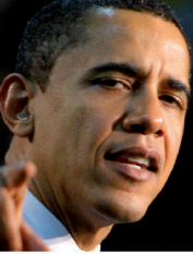
Barack Obama 190