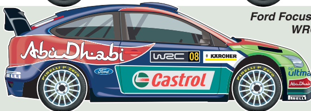
Ford Focus RS WRC07