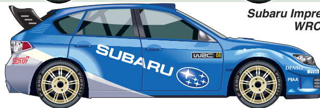
Subaru Impreza WRC08

Norway's Petter Solberg and Australia's Chris Atkinson return for the Japanese team, joined by Xevi Pons of Spain at the wheel of a third works car. Subaru is launching a totally new Impreza for 2008