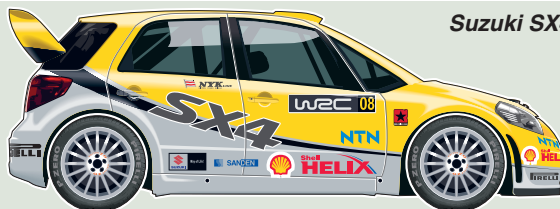
Suzuki SX4 WRC