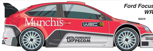
Ford Focus RS WRC06