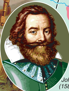
Captain John Smith (1580-1631)