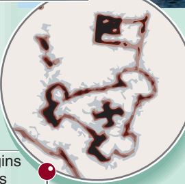
1607 drawing of Jamestown Fort

► 1612: Colonist John Rolfe introduces and successfully exports strain of tobacco. “Golden weed” will ensure colony's economic survival