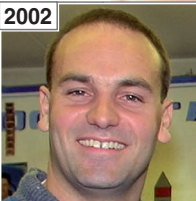
2002 South African internet millionaire Mark Shuttleworth