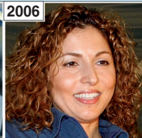
2006 Iranian-born U.S. telecoms tycoon Anousheh Ansari