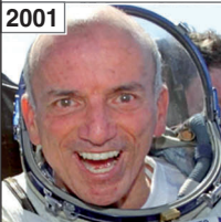
2001 U.S. financier and ex-NASA engineer Dennis Tito