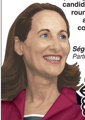
Ségolène Royal Parti Socialiste (PS)

Interior Minister Nicolas Sarkozy is set to be appointed UMP presidential candidate with polls giving him the slimmest of leads over Socialist candidate Ségolène Royal for the first round of voting in April. The pair are thought most likely to contest the second, head-to-head round on May 6