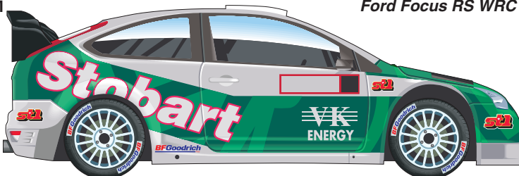
Ford Focus RS WRC 06