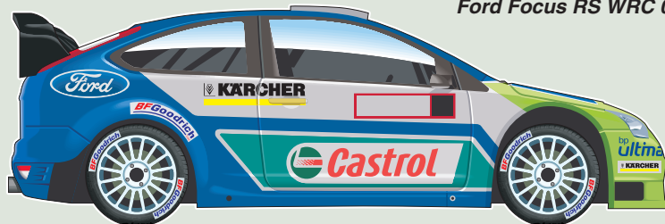
Ford Focus RS WRC 06

After a 27-year wait, Ford finally captured the manufacturer's title again and, with double champion Gronholm behind the wheel, they will be looking to go one step further and wrest the driver's championship from Loeb as well