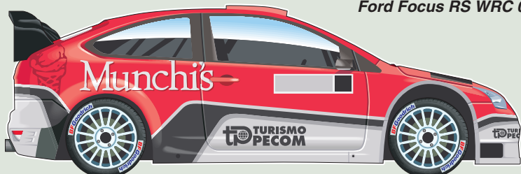
Ford Focus RS WRC 06