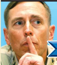
General David Petraeus