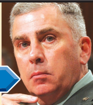
General John Abizaid