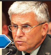
General George Casey