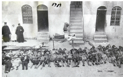
Victims of the "Great Slaughter" in Syrian city of Aleppo

● Massacre sites: Symbol size relates to scale of deaths