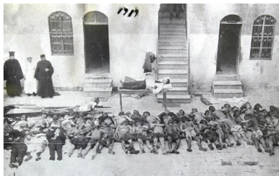
Victims of the "Great Slaughter" in Syrian city of Aleppo

● Massacre sites: Symbol size relates to scale of deaths