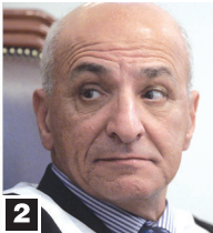
Rauf Rashid Abdel-Rahman, 64, Kurdish

Resigned citing government interference undermined court's neutrality and objectivity