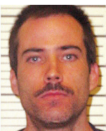
Eric Robert Rudolph

Mastermind of 1993 bombing of New York’s World Trade Center