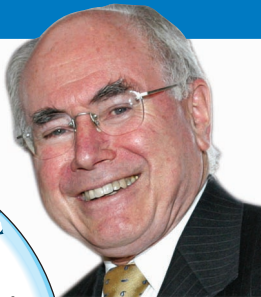
John Howard, 66

John Howard, poised to become only the second Australian Premier to achieve 10 years in office, has presided over a period marked by economic prosperity, security issues and firm foreign policy