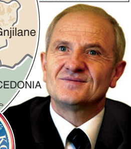
Kosovan President Fatmir Sejdiu:

Pledges to guarantee minority rights. Presidential flag used as unofficial flag of future Kosovan state