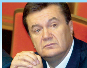
Viktor Yanukovich Opposes Euro-Atlantic integration, wants closer ties with Moscow. Kremlin and Russian energy giant Gazprom supplied half of Yanukovich's $600 million campaign chest