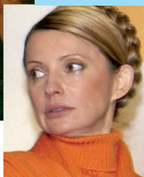
Yulia Tymoshenko Ukraine's wealthiest woman – and former energy minister – backs Yushchenko

Pora: Pro-democracy youth organization plans to mobilize two million people to protest nationwide