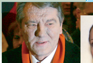
Viktor Yushchenko Pledges to strengthen ties with European Union

Pora: Pro-democracy youth organization plans to mobilize two million people to protest nationwide