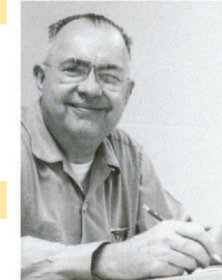
Clarence Leo Fender