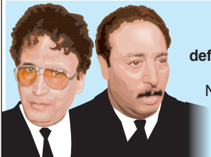
The defendants: Indicted November 1991

● Court: In session for 85 days. Judges retired January 18 to consider 10,232 pages of testimony from 235 witnesses