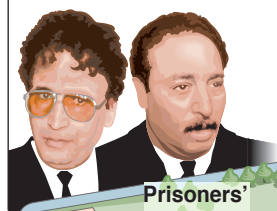
Libyan suspects Abdel-Baset Ali al-Megrahi (far left) and Al-Amin Khalifa Fhimah

Legal history has been made with the pre-trial hearing of two Libyans charged with the bombing of Pan-Am flight 103 over Lockerbie in 1988. The Dutch government has ceded Camp Zeist to Britain for the trial's duration, allowing the suspects to be tried on Scottish soil under Scottish law