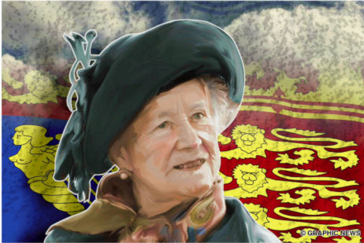
Filename: GN5140 (P) Queen Mother #1