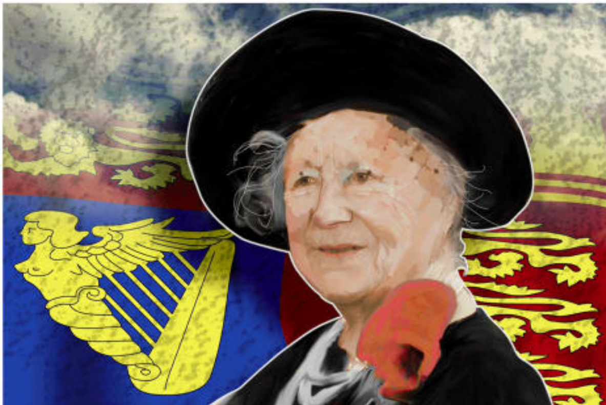
Filename: GN5141 (P) Queen Mother #2