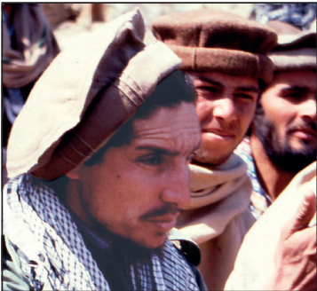
General Ahmed Shah Massood