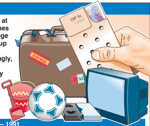
Average income levels (£) – 1991

One-parent households are at a disadvantage when it comes to money – having an average weekly disposable income up to 62% lower than a couple who both work. Unsurprisingly, families have higher bills, for example, average weekly outlay on leisure is 37% more than in households without children